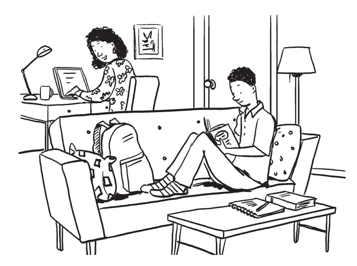
Editor's note: Guidelines are changing rapidly. Make sure to follow all local, state, and federal laws and recommendations on social distancing and other practices when using these ideas.

Keep your children learning and safely occupied while they're not in school and can't hang out with friends. This guide features tween- and teen-friendly activities and challenges, including a bingo card on the back.